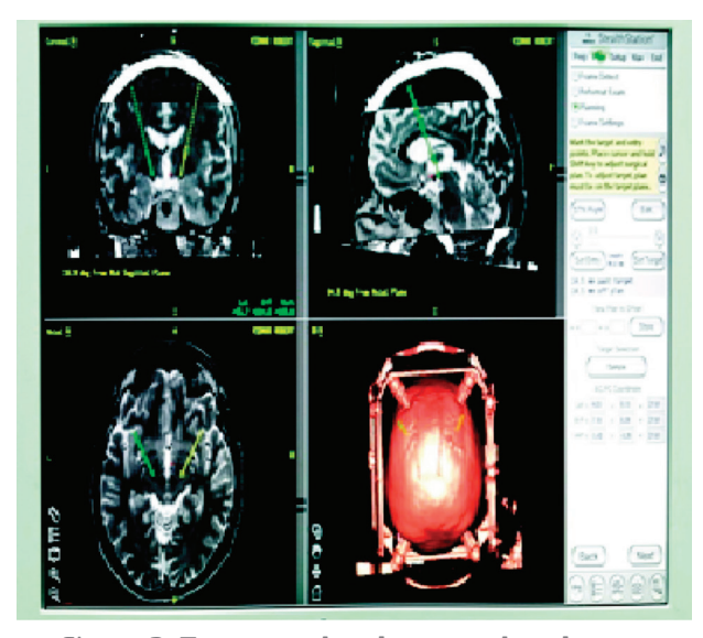
Figure 3. Target and trajectory planning on STN bilaterally as a part of DBS preparation

Four graphs in Figure 4 show the results our patients reported on preoperatively. In assessing their walking ability, 20 patients noted that they always needed assistance, 57 of them noted how they sometimes need assistance, while 5 patients reported never having the need for assistance. For eating the results were as follows: 8 patients always needed assistance, 67 sometimes and 20 patients never needed assistance. In their assessment of their ability to clothe independently, 16 patients noted always needing assistance, 53 sometimes, while 26 patients