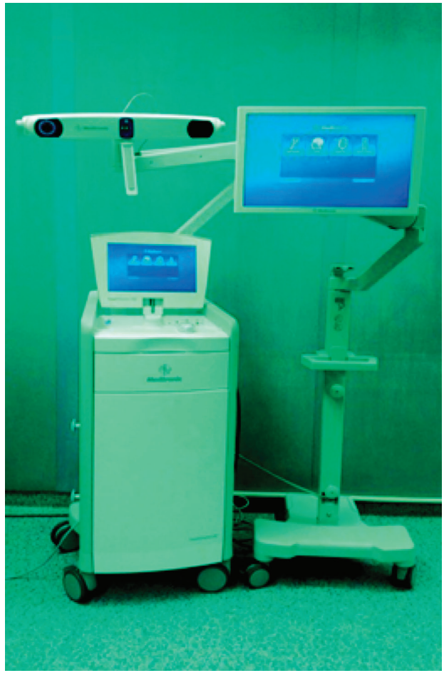
Figure 2. Device for DBS planning, StealthStation S7

If the position is correct and there are no signs of complications the second part of the surgery starts. The second part is performed in general endotracheal anesthesia. It consists of extension placement and connecting the electrode to the battery (Activa PC). The battery is placed subcutaneously in the left pectoral region. The stimulation starts on the 3<sup>rd</sup> day after surgery and at that moment the patient usually experiences instant improvement.